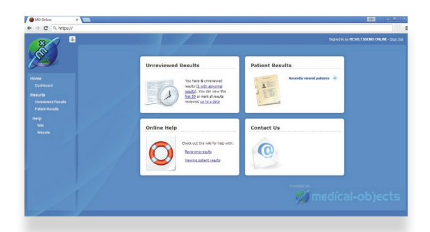
Online Results Dashboard

The Online Results Web Portal is a simple but secure means of providing access to results for your mobile referrers. The solution is accessed via web browser, and also available on mobile devices; therefore ideal for referrers located in public or private hospitals.