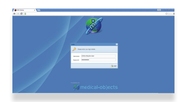
Online Results Login