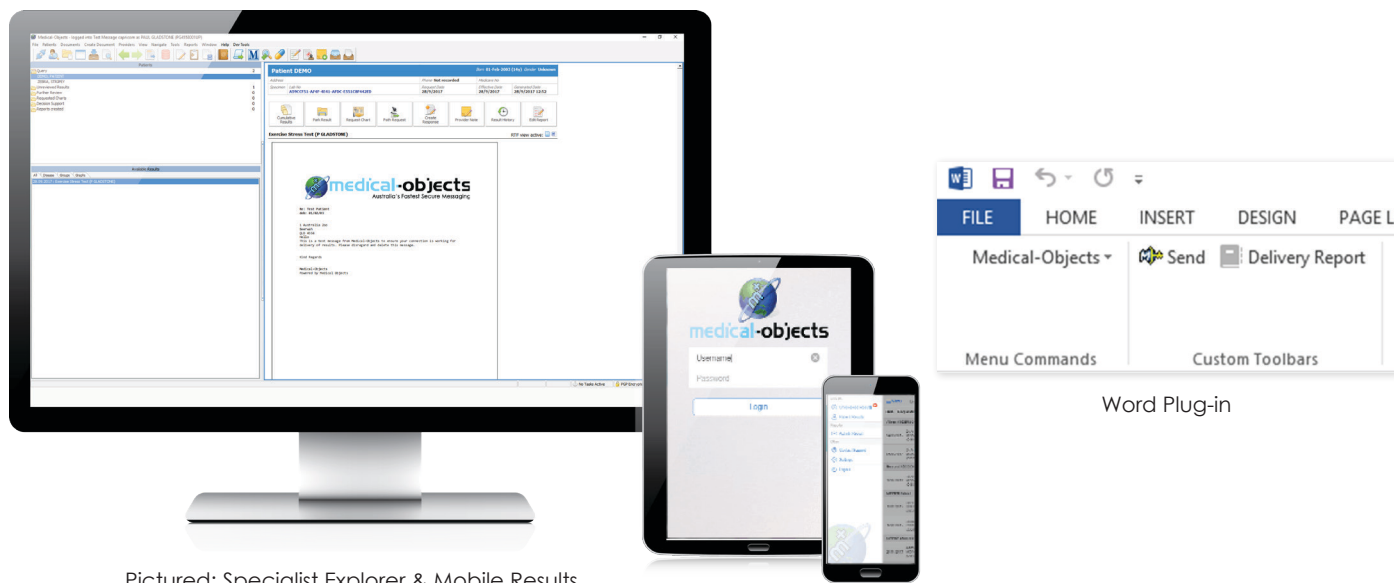
Pictured: Specialist Explorer & Mobile Results

Our Practice Software is fast, secure and easy to use. Easily manage all your patients and their reports from progress notes to incoming and outgoing clinical correspondence. With integrated secure messaging you can send letters directly from the practice software or Word Plugin to other health providers on our network. You can even send more complex reports in PDF format.